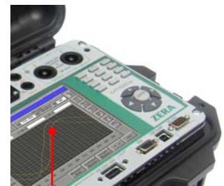
6.5" Touch screen